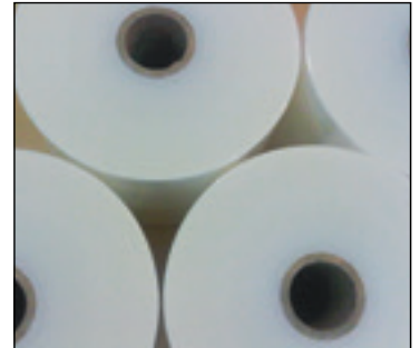
Variety of sizes and thicknesses